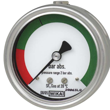
Gas density indicator model GDI-063