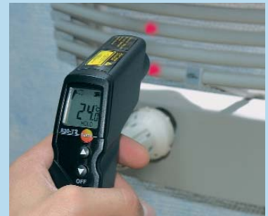
Reliable measurements with laser sighting