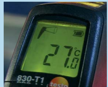
Easy-to-read display with illumination