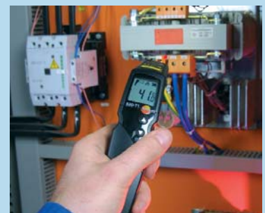
Measurement on live or moving parts