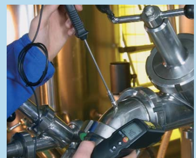
Connection for external temperature probes (testo 830-T2)